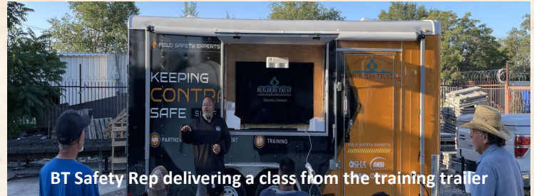
BT Safety Rep delivering a class from the training trailer